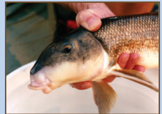
Sucker species (e.g. White Sucker, pictured) with SUCKER mouth and NO BARBELS (whiskers). Eyes sit high on the head