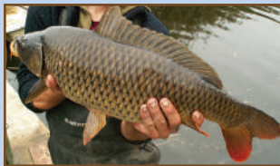
Common Carp with DEEP body