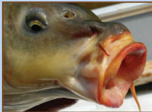
Common Carp with SUCKER mouth and BARBELS (whiskers). Eyes sit relatively high on the head