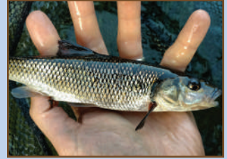
Fallfish with SHORT dorsal fin and MODERATE SCALES. Eyes sit relatively high on head