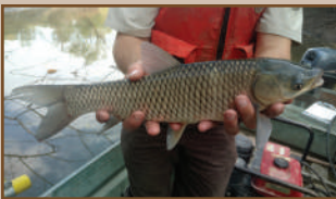
INVASIVE Grass Carp with SLENDER head and body

Asian Carps Regional Coordinating Committee