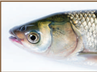
INVASIVE Grass Carp with JAWED mouth and NO BARBELS (whiskers). Eyes are low and sit in line with mouth

Asian Carps Regional Coordinating Committee