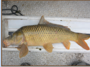
Common Carp with LONG dorsal fin and LARGE SCALES