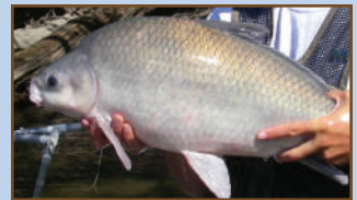
Smallmouth Buffalo with DEEP body