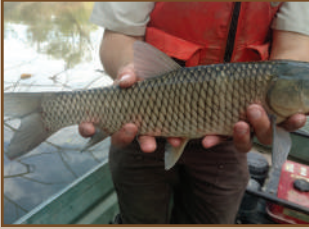
INVASIVE Grass Carp with SHORT dorsal fin and LARGE SCALES

Asian Carps Regional Coordinating Committee