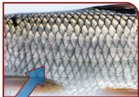
Asian Carp Regional Coordinating Committee

Grass Carp have a JAWED mouth and do NOT have a SUCKER mouth